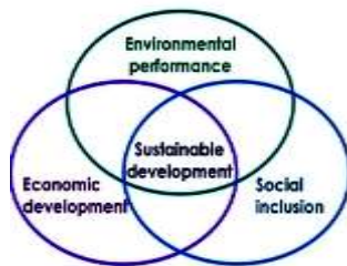
Fig 1: A simple illustration of the sustainability development model (Globalpermaculture 2011)

The concept of sustainability is not entirely new with the connection between the quality of life and the environment was first considered in the United Nations Conference of 1972. However, it was not until the Brundtland Report of 1987 that the consideration of the concept as an exploration of social equity, environmental quality and economic development was clearly established. Sustainability development was considered in the Brundtland report as development that guarantees the satisfaction of the needs of the existing generation while ensuring that the ability of future generations to meet their own needs is not compromised (Rogers, Jalal and Boyd 2008, Kuhlman and Farrington 2010). An illustration of a simple sustainable development model is shown in Figure 1